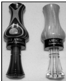
Hand Carved Calls by Conoloway Bay Duck Calls